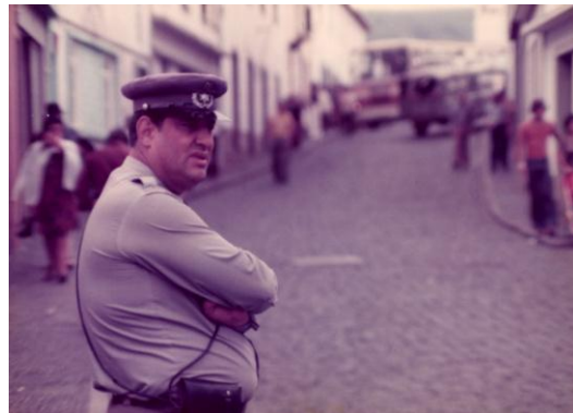
Portuguese Police Officer in the Azores

Many of the ethnically Portuguese residents in the Central Valley trace their heritage back to the Azores.